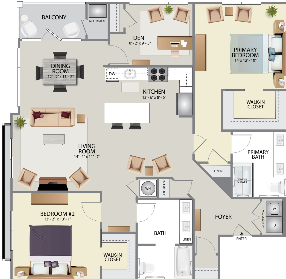
2ND - 5TH FLOOR