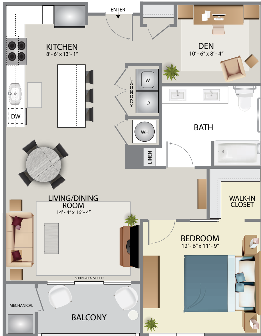
2ND - 5TH FLOOR