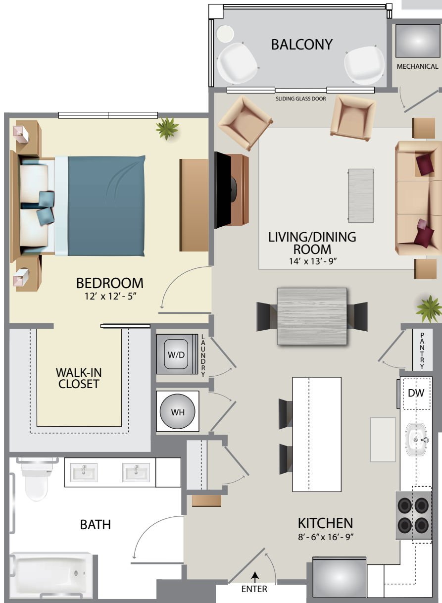
2ND - 5TH FLOOR