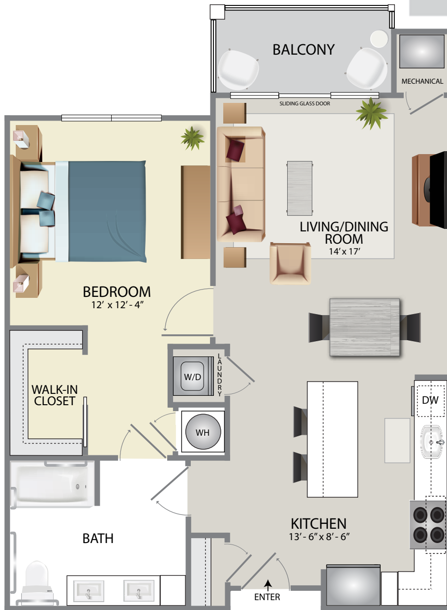
2ND - 5TH FLOOR