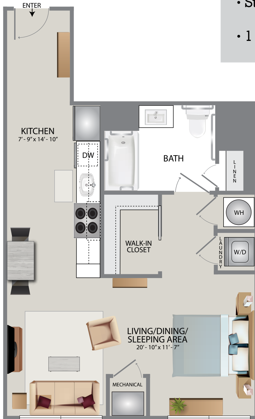
2ND - 5TH FLOOR